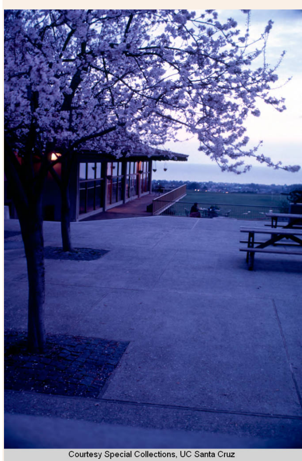
Monterey Bay vista from Cowell College

The LASC Dinner and Celebration will be held at the Cowell Provost House from 5:45pm to 8pm . Dinner will be served at 6pm. The Cowell Provost House is a pleasant walk from Humanities or Stevenson College, and any local will gladly show you the way.